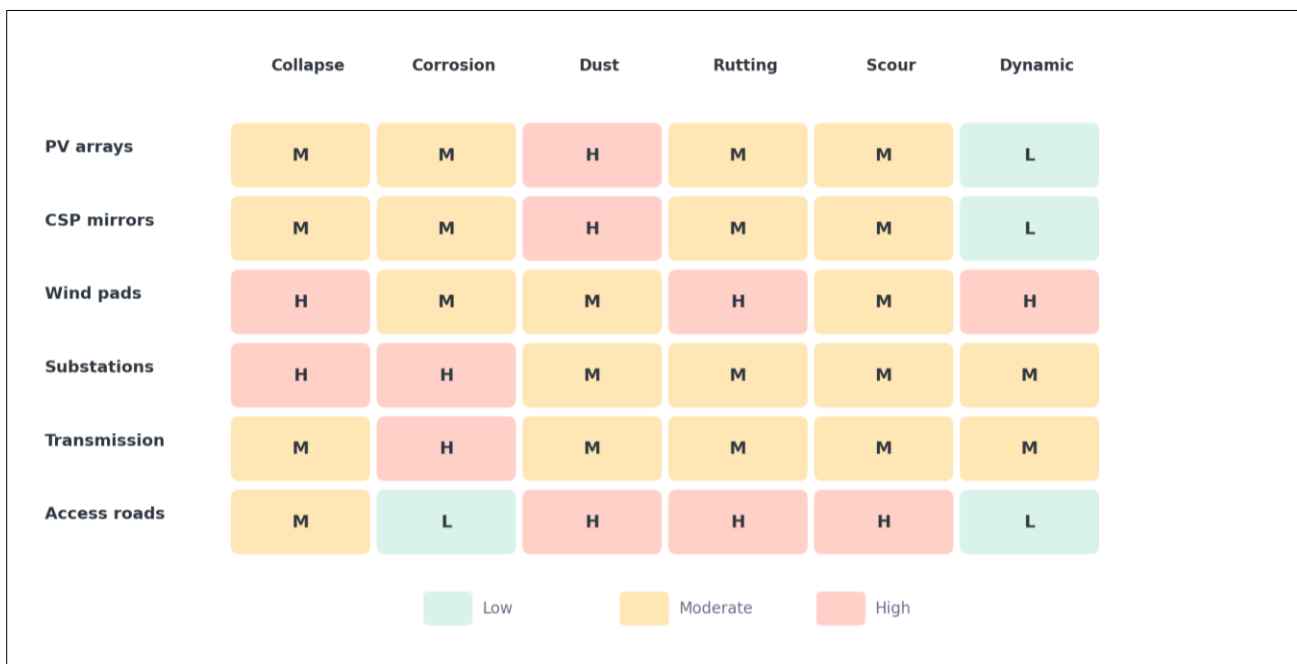
Figure 2: Asset-hazard screening matrix showing relative risks for common renewable-energy and grid assets on sabkha terrain